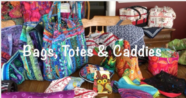
Bags, Totes & Caddies